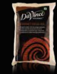
Gourmet Cocoa Mix